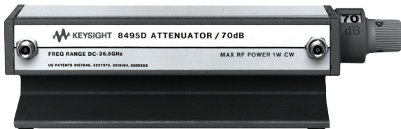
Figure 3. Manual step attenuators.

Keysight manual step attenuators offer fast, precise signal-level control up to 26.5 GHz. Unmatched attenuation repeatability of less than 0.03 dB up to 5 million cycles per section ensures low measurement uncertainty. Attenuation range of 121 dB in 1 dB step can be achieved by cascading 2 attenuators in series.