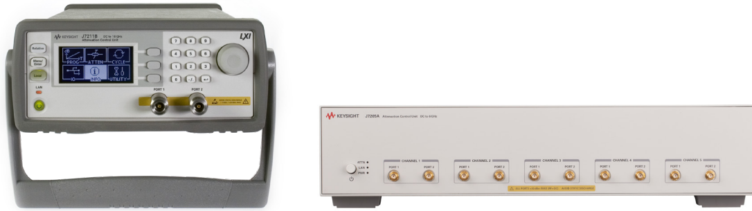
Figure 5. Attenuator control unit.