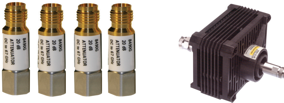
Figure 2. Coaxial fixed attenuators.

Keysight coaxial fixed attenuators provide precise attenuation, flat frequency response and low SWR over broad frequency range. These attenuators are available in nominal attenuations of 3, 6, 10, 20, 30, 40, 50 and 60 dB to cater to various applications and setups.