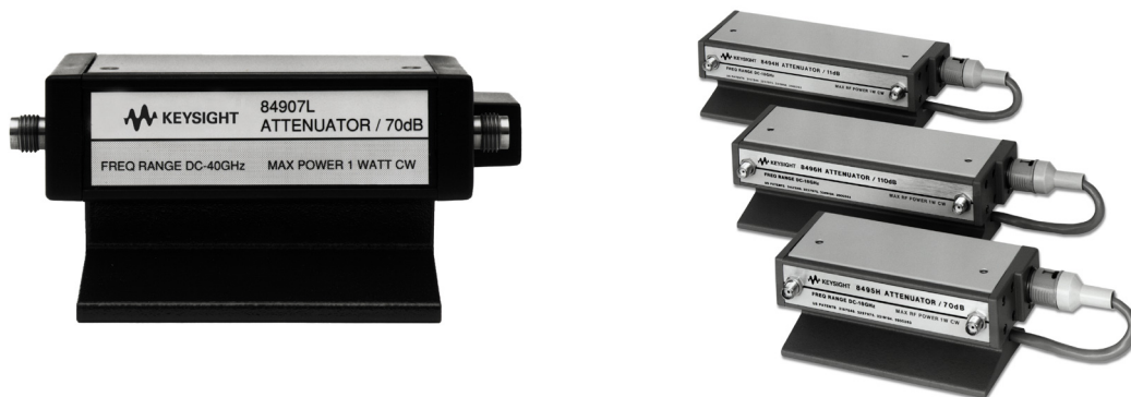
Figure 4. Programmable step attenuators.

Keysight programmable step attenuators offer fast, precise signal-level control up to 50 GHz, with switching time of less than 20 ms. Unmatched attenuation repeatability of less than 0.03 dB up to 5 million cycles per section ensures low measurement uncertainty and reduces calibration cycles when installed into test systems. Automatic GPIB/USB/LAN drive control is achieved with the 11713B/C attenuator/switch driver.