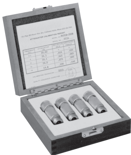
Figure 7. Coaxial fixed attenuator set.

Sets of four coaxial fixed attenuators with attenuations of 3, 6, 10 and 20 dB are provided in a walnut accessory case. These sets are ideal for calibration labs or where precise knowledge of attenuation and SWR is desired.